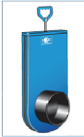
Type IC-S. Gate valve for slurry and sludge removal.